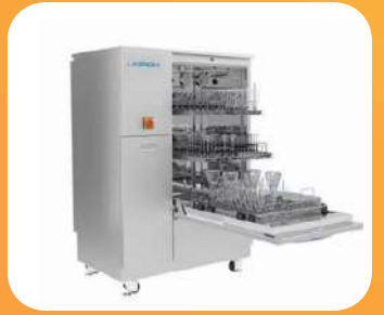
LABORATORY GLASSWARE WASHER