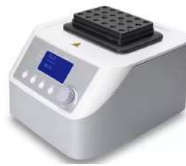
DRY BATH/THERMO MIXER