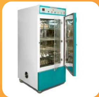
COOLING B.O.D INCUBATOR (LCI)