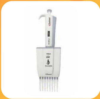
MICROPIPETTE (8-12 CHANNEL)