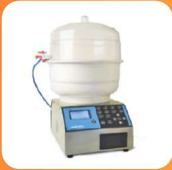
LEAK TEST APPARATUS