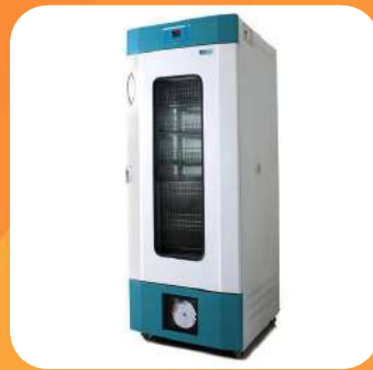
BLOOD BANK REFRIGERATOR