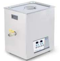
ULTRA SONIC CLEANER