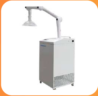
MOBILE FUME HOOD