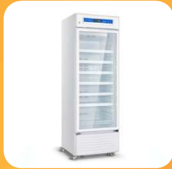
2-8 DEGREE LAB REFRIGERATOR