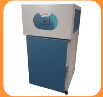
-80 DEG C DEEP FREEZER