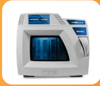
MICROWAVE DIGESTION / SYNTHESIS