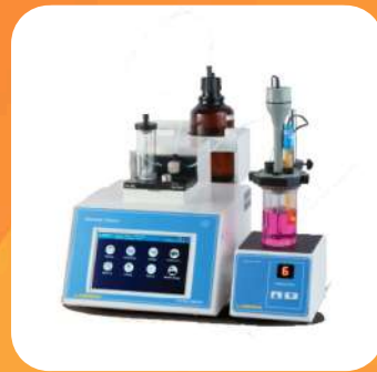
POTENTIOMETRIC / AUTO TITRATOR