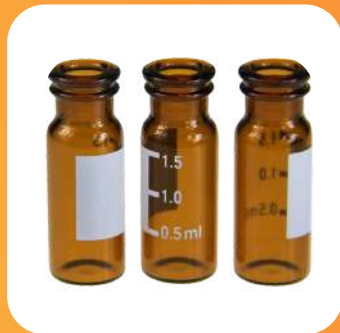
VIALS - AMBER GLAS