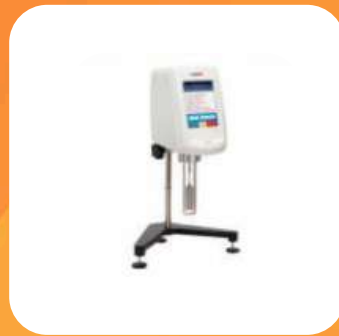
DIGITAL ROTATIONAL VISCOMETER