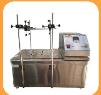
CONSTANT TEMP WATER BATH