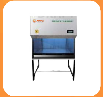
BIO SAFETY CABINET