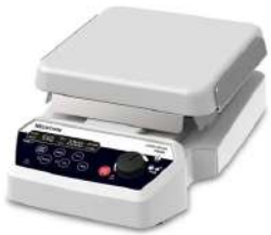
HOT PLATE STIRRER