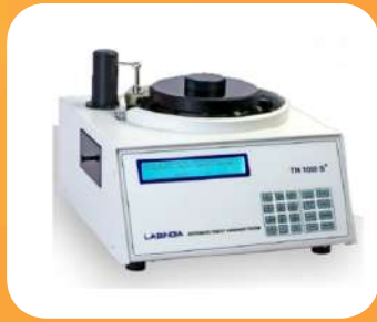
TABLET HARDNESS TESTER