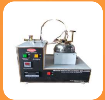
FLASH POINT APPARATUS