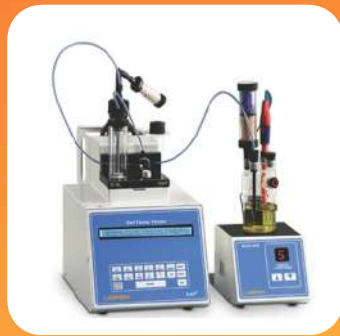
KARL FISHER TITRATOR