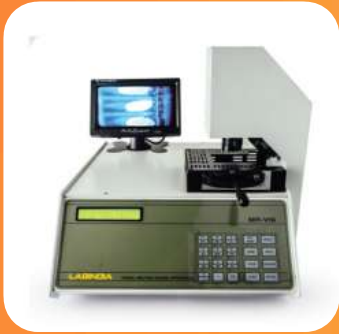
MELTING POINT APPARATUS