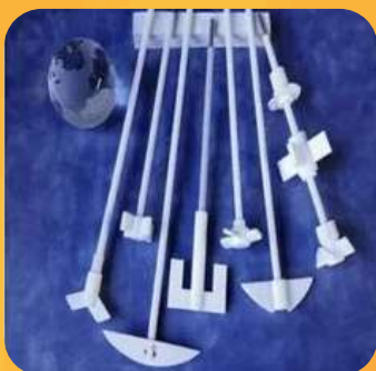
STIRRING ROD / TEFLON BLADE