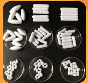
MAGNETIC STIRRING BARS/ BEADS