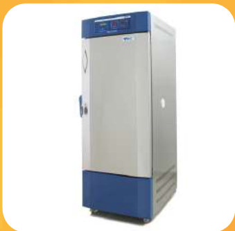
STABILITY TEST CHAMBER LSC