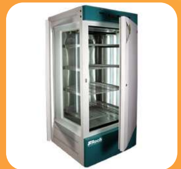
PLANT GROWTH CHAMBER (LGC)