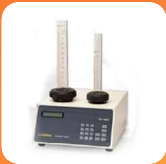
TAPI BULK DENSITY APPARATUS