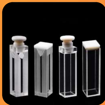
QUARTZ CUVETTE & CELLS