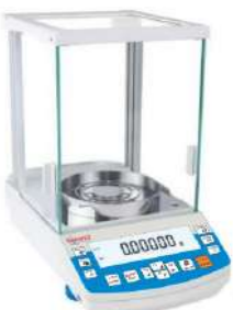
SEMI MICRO BALANCE