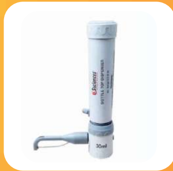
BOTTLE TOP DISPENSER SPECIFICATIONS