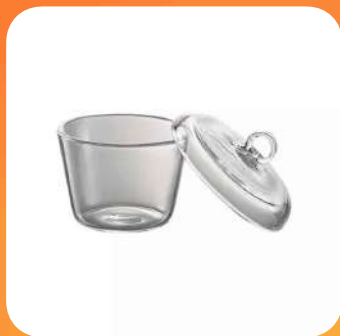
CRUCIBIES & LIDS