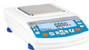
HIGH PRECISION BALANCE