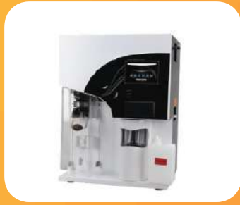
KJELDHAL PROTEIN ANALYZER