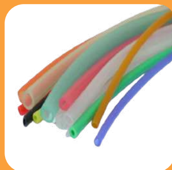
RUBBER / SILICONE TUBES