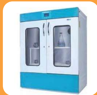
ORBITAL SHAKING INCUBATOR (LSI)