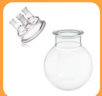
QUARTZ REACTION VESSEL